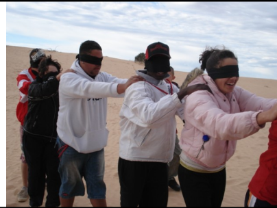
Team building activities