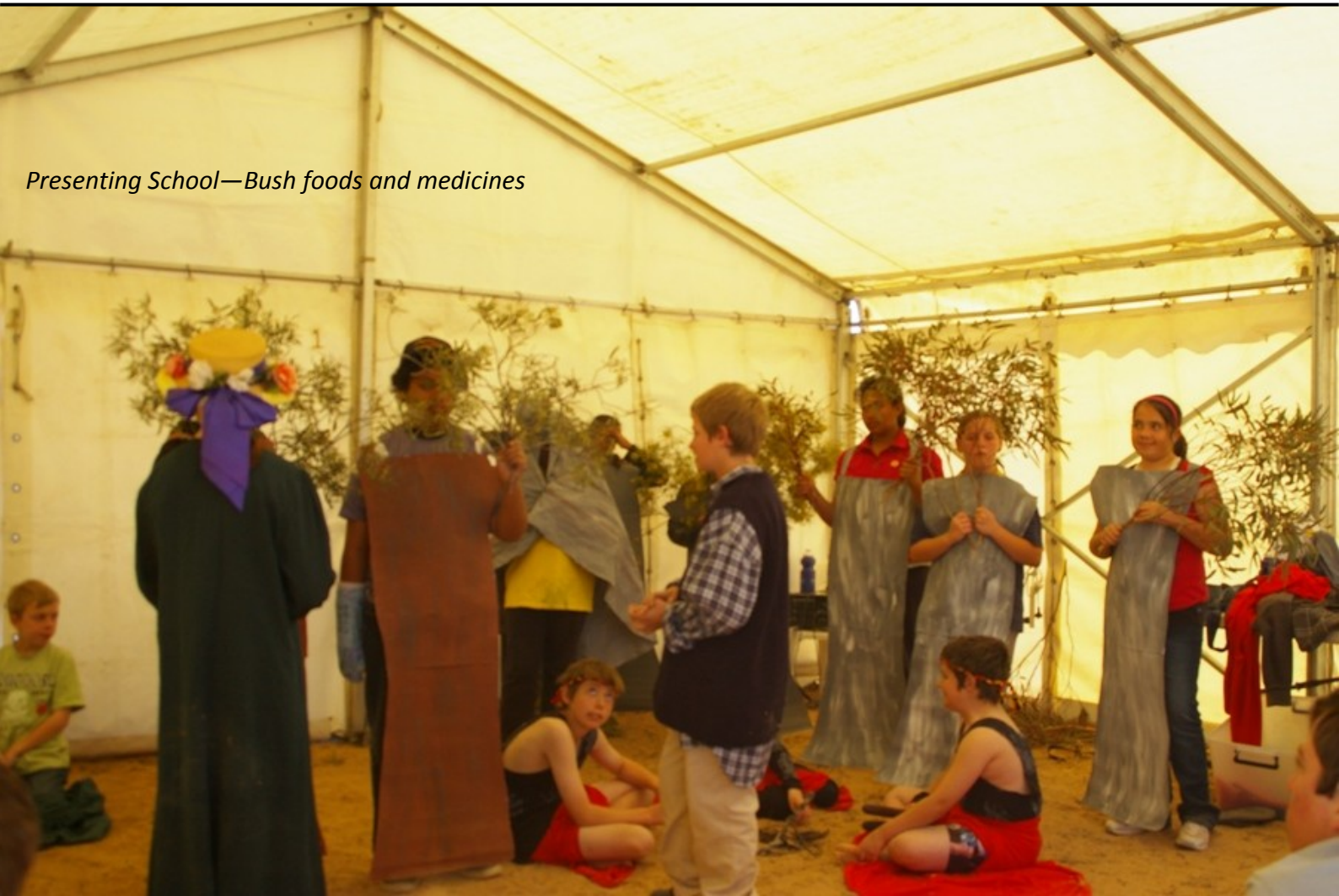
Presenting School—Bush foods and medicines