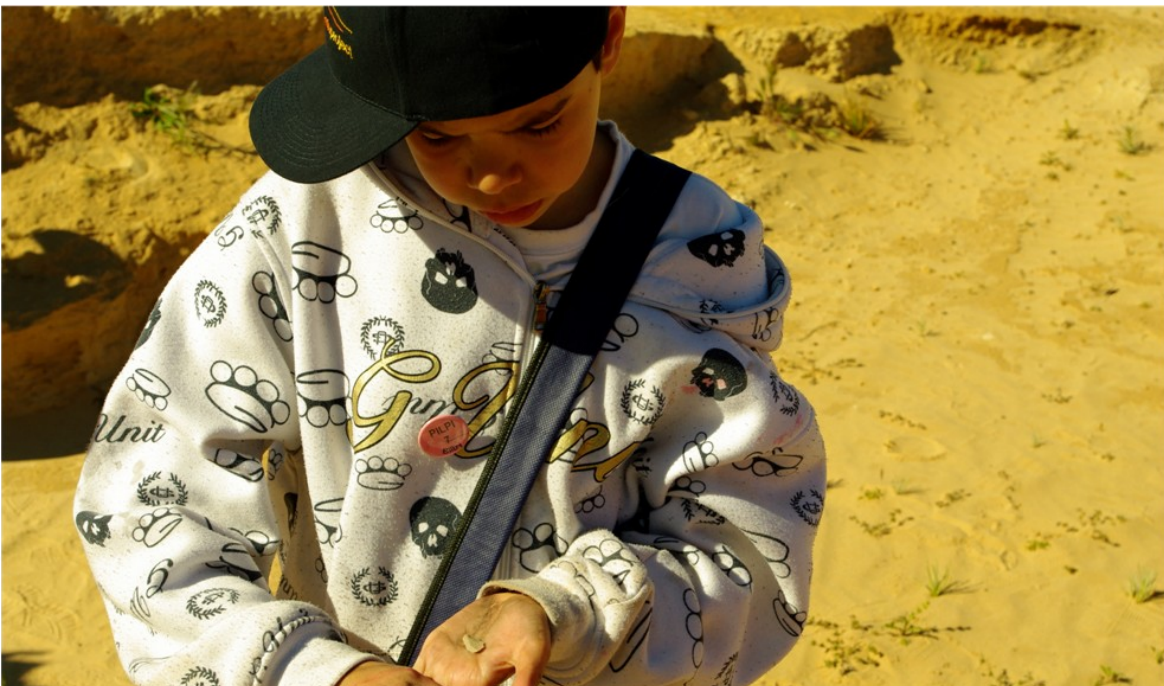
Budding archeologist with 45,000 year old Genyornis egg shell