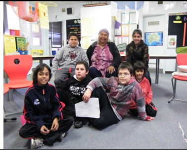
Mentor visits to schools